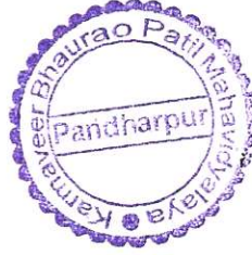
PRINCIPAL KARMAVEER BHURAO PATIL MAHAVIDYALAYA, PANDHARPUR.